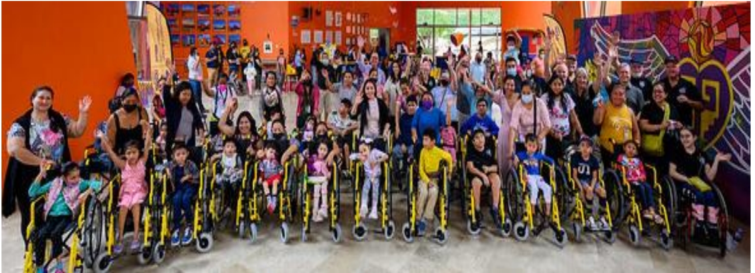
WHEELCHAIR DELIVERY, FEBRUARY 2023, MERIDA, MEXICO