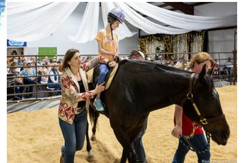
ANSWERING PRAYERS FOR WHEELCHAIRS & HORSES - JUNE 2022